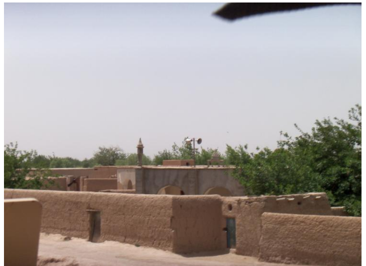
A typical example of a walled compound found throughout the Helmand.