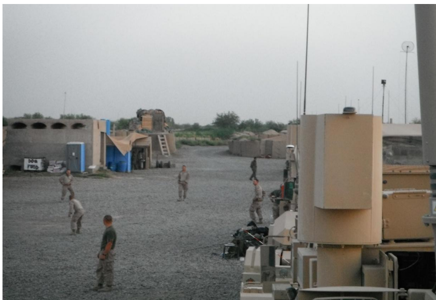
One of 3rd Platoons favorite post mission past times, tossing the pigskin or Frisbee around