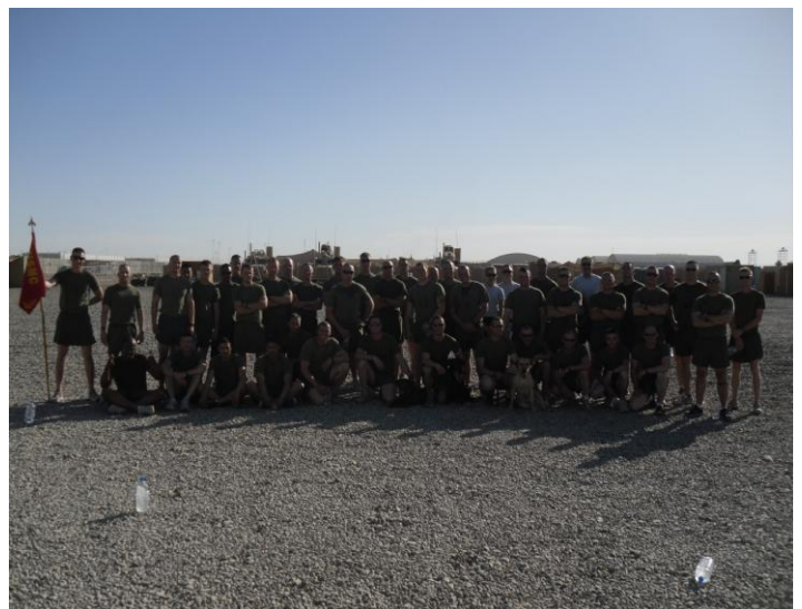
A group photo of the participants taken just after the completion of the memorial remembrance run.