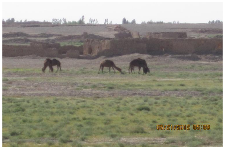
Set against the backdrop of the typical "canal zone" landscape, a few Camels lazily grazing and roaming about.