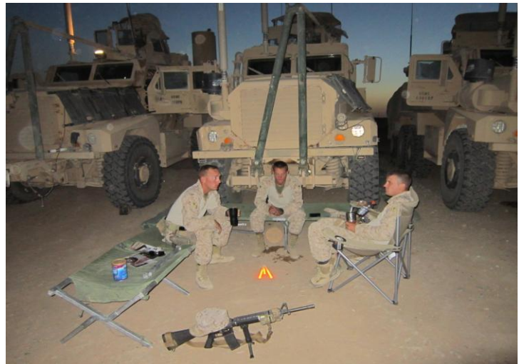
After a long day of patrols, there is nothing better than relaxing with your fellow Marines around the "chem-stick" fireside.