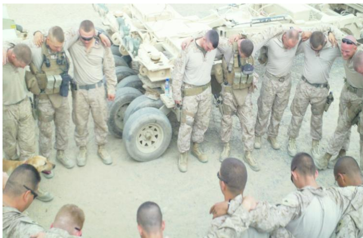
3rd Platoon gathers for a prayer prior to going out on a mission