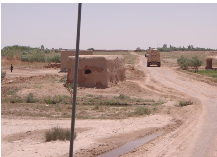
Another view of the typical landscape one would find in canal zone(s) of the lower Helmand province