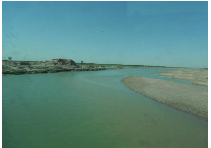
The beautiful Helmand River; which is truly the life line for the Afghans