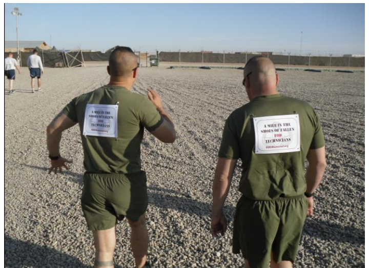
The CO and XO prepare to "step-off" and run in a "mile in the shoes of the fallen EOD techs" in support of the memorial remembrance.