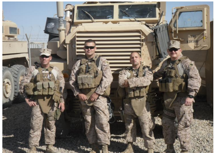
Team "Top" striking a pose outside their MRAP.