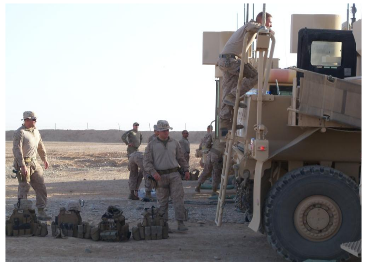
Marines stage their gear and ready the vehicles prior to a patrol