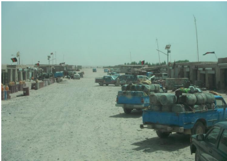
One of the many, and typical, bazaars found throughout the Helmand Province