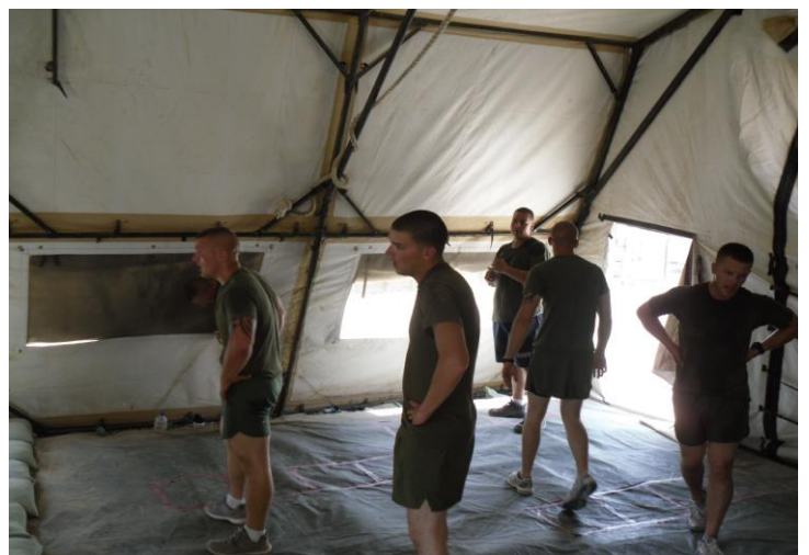
Insanity has broad based appeal as members of 3rd Platoon attempt to regain their breath after getting Shaun T'd.