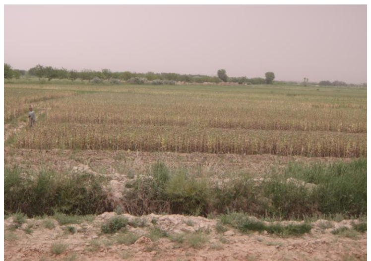
A picturesque view of the vast fields that encompass the canal zones in the lower Helmand province.