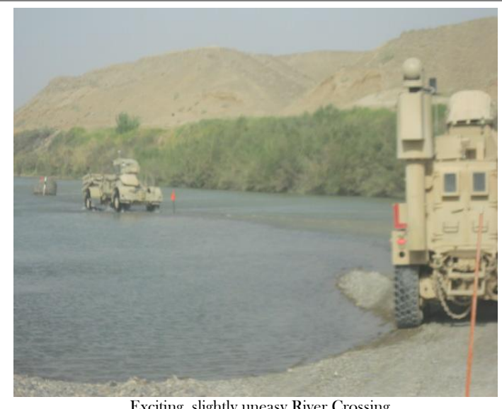
Exciting, slightly uneasy River Crossing