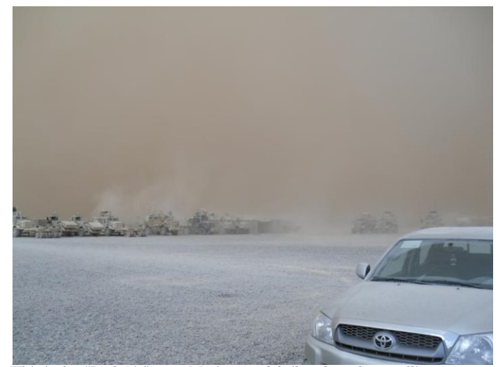
This is the "Red Air" your Marines and Sailors have been telling you