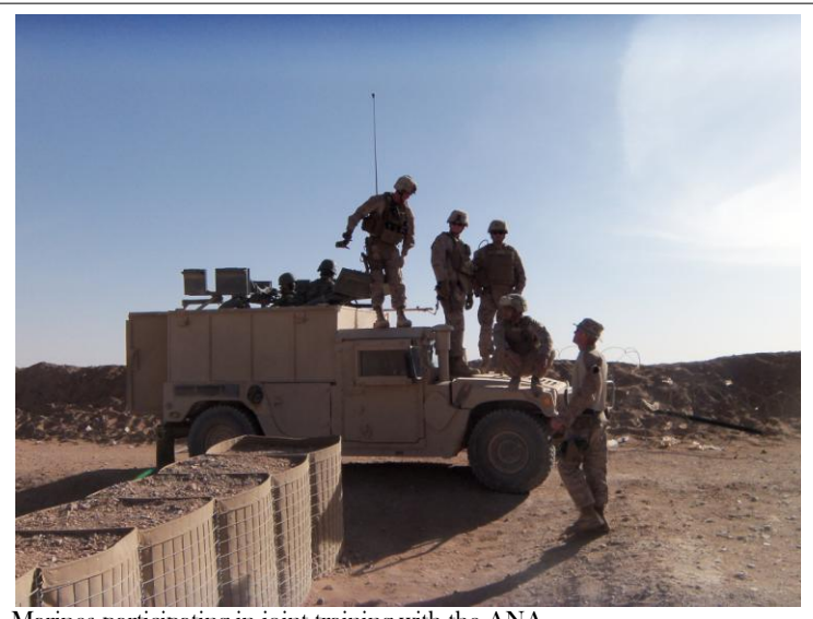
Marines participating in joint training with the ANA