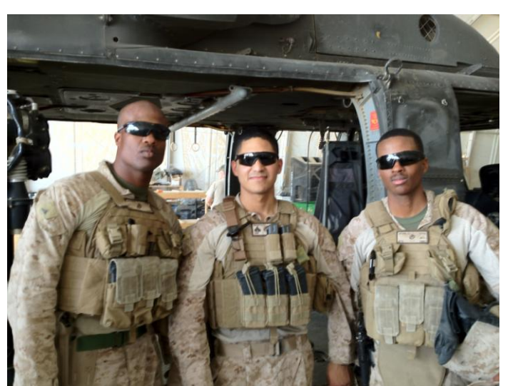
Camp Dwyer's version of Top Gun.