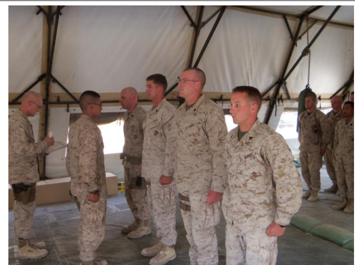
Marines of 2d Platoon graduating from the local Marine Corps Martial Arts course.