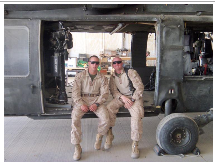
Put a Marine in a Helo and he is a little boy all over again.