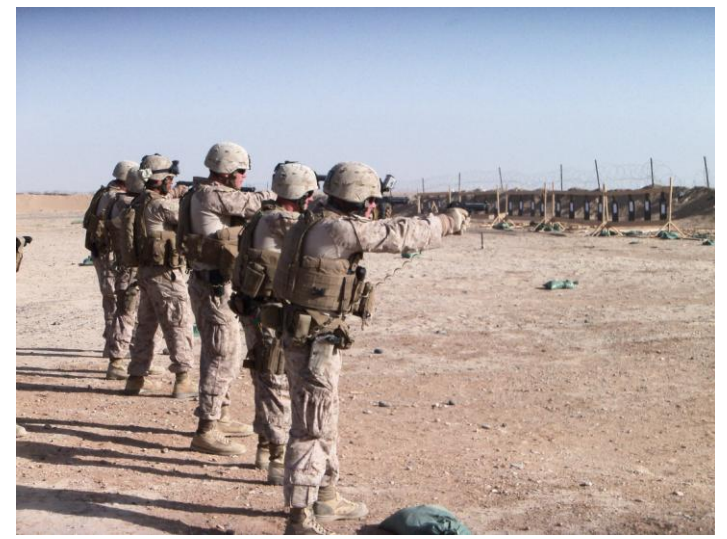
2d Platoon honing their pistol marksmanship skills