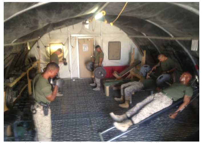
\overline{\mathbf{A}} few of the Company members availing themselves of all Pressure Plates has to offer.