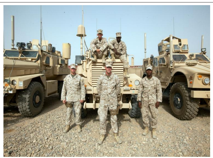
The Advisor Team strike's a pose in front of a RCC vehicle gear set.