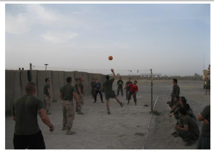
3d Plt vs ANA, we won but all had fun