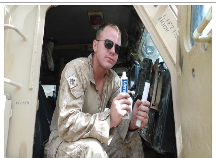
Oral hygiene is important no matter the clime or place!