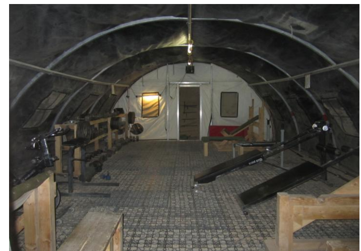
The inside of "Pressure Plates"; the Company's "Spartan" gym. The locale is a bit out of the way but memberships are affordable!