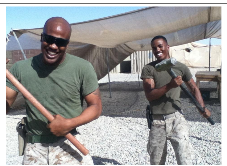
If only they exerted the same amount of energy actually working!